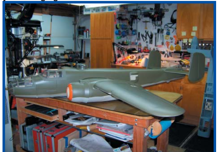
This is the KMP 96" B25 mocked up on my bench. It will undergo a complete scale makeover. Power will be electric and Robart retracts & brakes.