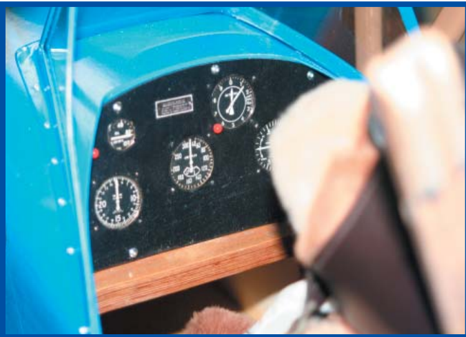
The cockpit features custom gauges with copper rings for bezels filled with clear epoxy. If it doesn't exist, Richard will make it! Nice project too!