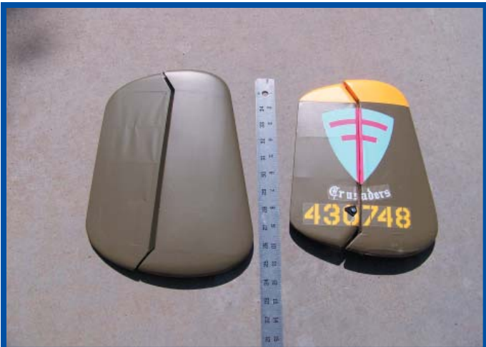
Sam Wrights new KMP 96" B25 vertical stab, next to what is left of the 83" wingspan stab. I know what not to do on this one.