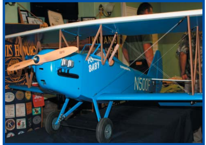
Nice front view of the big Fly baby. Powered by a new Evolution 58GX engine with ignition. The N wing struts are all molded for a better look.