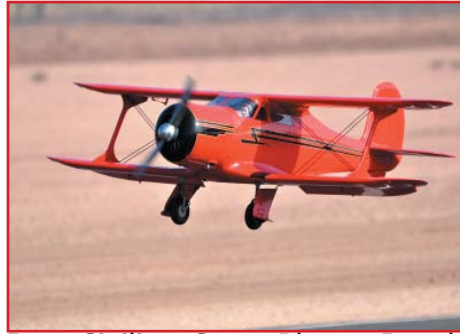
Best Civilian Great Planes Beech Staggerwing with lots of neat details added.