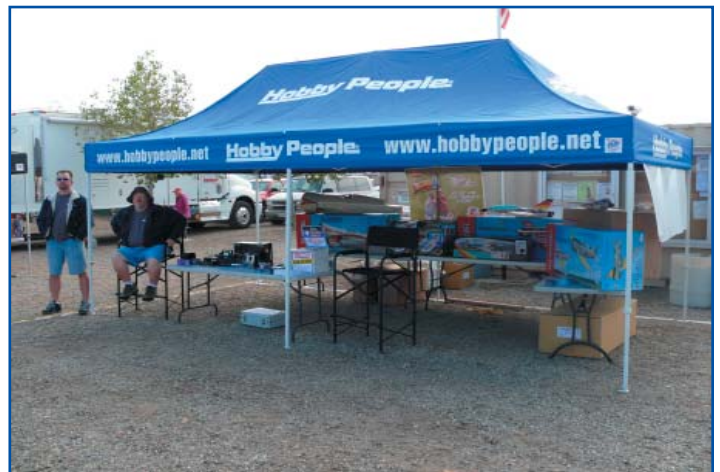
Hobby People's booth with their new scale aircraft on display. Several other vendors joined the vendors row and added to the festive look of Wings over chino.