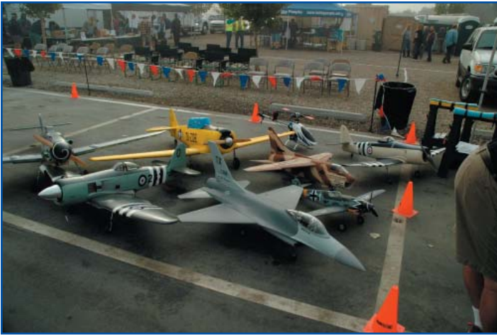
Just some of the cool aircraft arriving as soon as the gates were open at 7:30am Saturday.