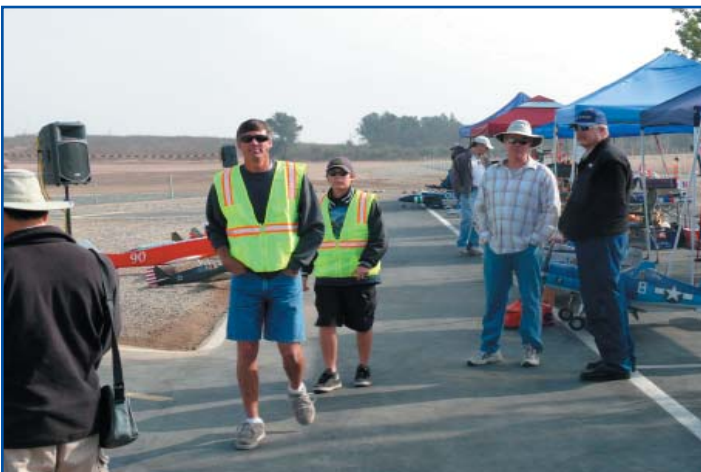
Flight line monitors and taxi way marshalls in the green vest kept things moving smoothly throughout the event. A job well done.