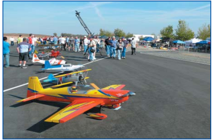
Only part of the long line of scale aircraft for the noon time line up. This was for the public and the silent judges to view the aircraft.