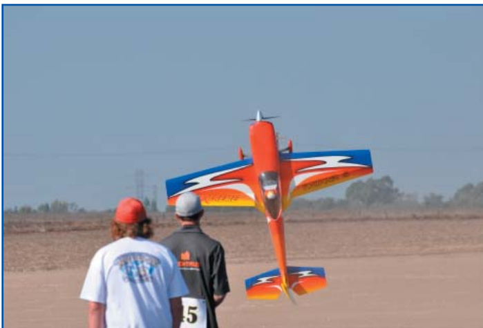
More of the close up 3-D freestyle act, up close, cool and personal. Matt Szeubar at the controls and Cody calling for him.