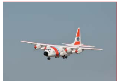
A Hobby People C-130 Hercules on 4 35 glow engines.