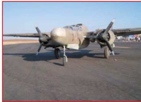
Dave Morales highly detailed P-61 Black Widow