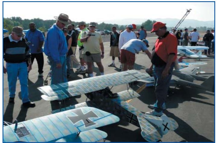
More admirers at the Saturday noon line up. Lots of neat WWI, WWII, new military era and civilian aircraft at the event with 65 registered pilots.