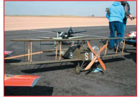
Don Holfeldts Best Electric prop Plane A WW! DH?