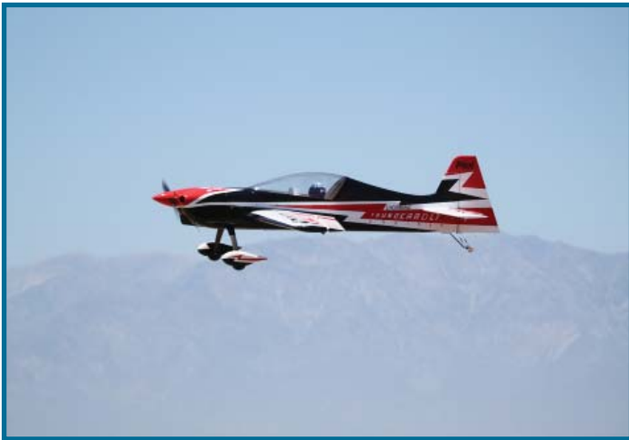
The array of aircraft was dazzling from various manufacturers. This one is from the PILOT ARF kits. Becoming popular on the entry level scene.