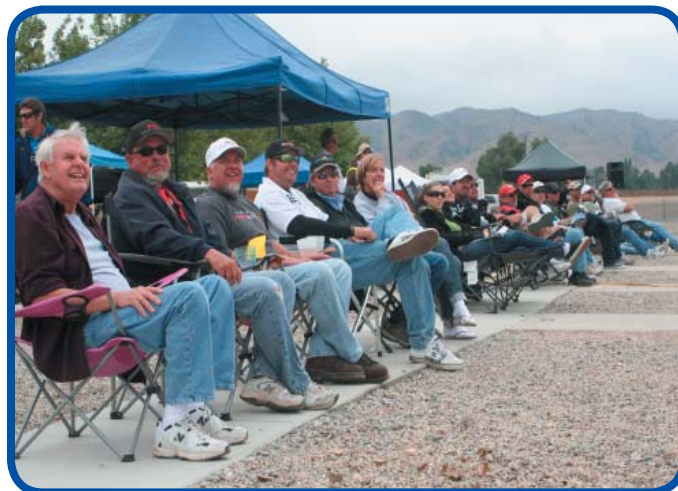
The Free Style judges and cheering section during the high energy freestyle competition with great music on Sunday afternoon.