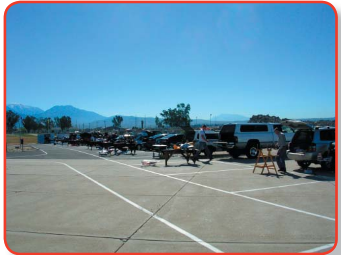
Typical weekend at the PVMAC Norton Field.