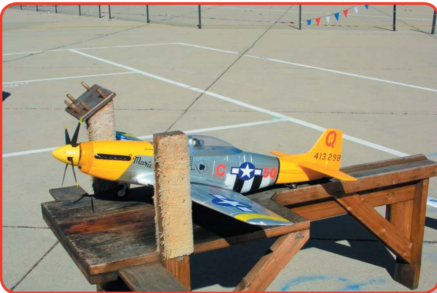
Engine starting stands at the Norton Field.

PVMAC Meeting Tuesday APRIL 12, 2011 7:00 PM Chino Community Center