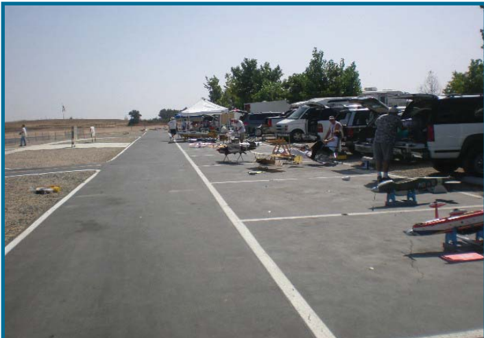
When you are as lucky as we are in the PVMAC with our great flying sites, who could resist coming out and flying.