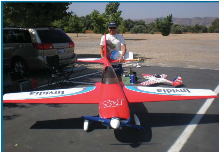
Joseph Wang / Extra 260 with DLE 170 power.