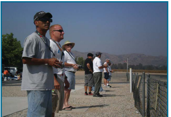
An average beautiful Saturday of flying at Prado.