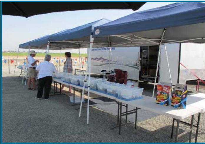
Aero Vista Hobbies on site with an impressive booth and lots of neat RC hardware. They generously donated Three RCGF Gas engines for the raffle.