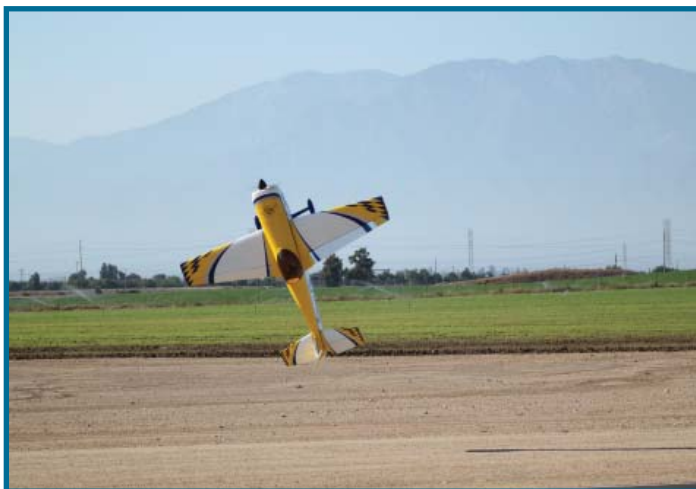
A sample of freestyle. Close up and personal and to music. Many with smoke. My favorite part of the event.