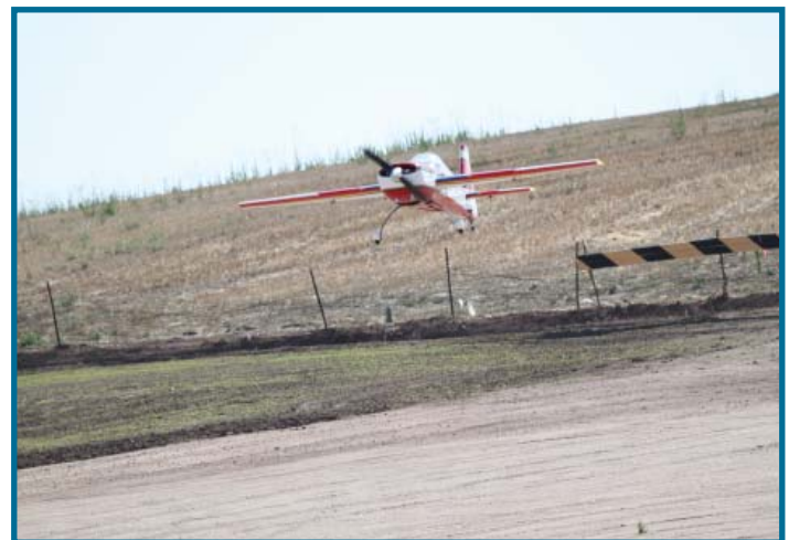
A view of the approach and how nice the field looked. The farmer next door had just watered his crop & the green provided a neat backdrop for the event.