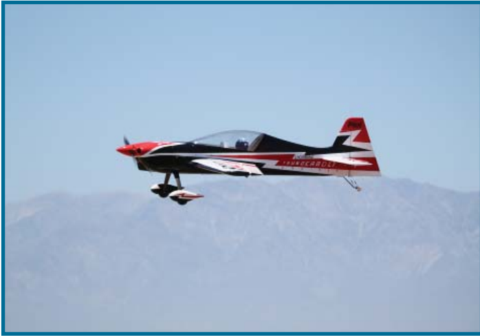
The array of aircraft was dazzling from various manufacturers. This one is from the PILOT ARF kits. Becoming popular on the entry level scene.