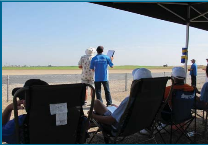
A view over the judges shoulders at a pilot and his caller. Note the pilot & caller to the right. They are airborne to move into the box as the judged pilot lands.