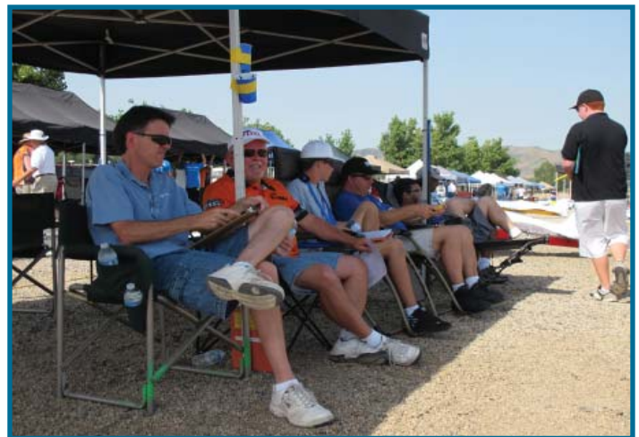
Each competitor pilot had three sets of eyes scoring his maneuvers. Many of the judges were rotating pilots judging a different class than theirs.