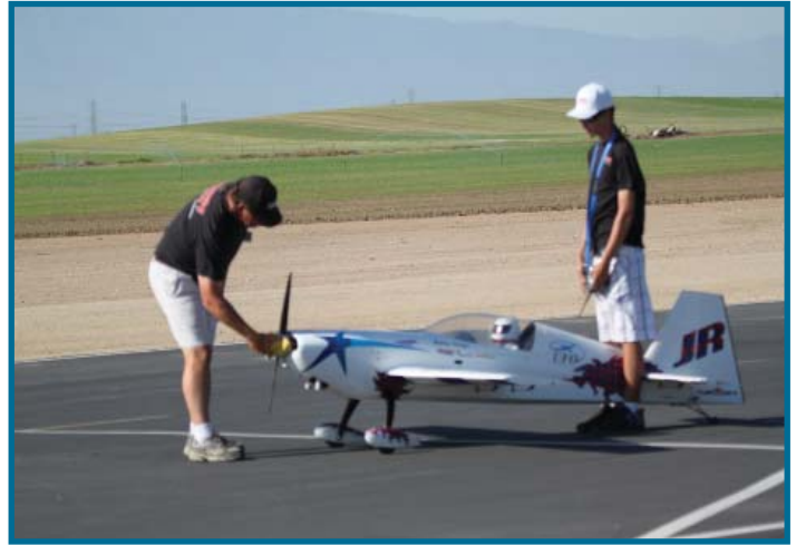
Another example of teamwork at the event. Note the green field and how nice the graded overfly area looks. Many great comments were received from the pilots.